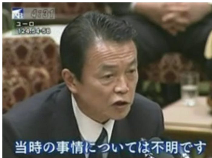
Prime Minister Aso telling the Diet he knew nothing about POWs at an Aso family coal mine until December 2008 (Tokyo Broadcasting System, March 9, 2009)

The Foreign Ministry, in its February 27 written response to my written question, stated that the Japanese Embassy and Consulate General in Australia did inform the Ministry in Tokyo of these news stories by official cable. But Prime Minister Aso, who was foreign minister at that time, answered my question during the House of Councillors' Budget Committee meeting on March 9 by saying, "I have absolutely no recollection of receiving such a report."