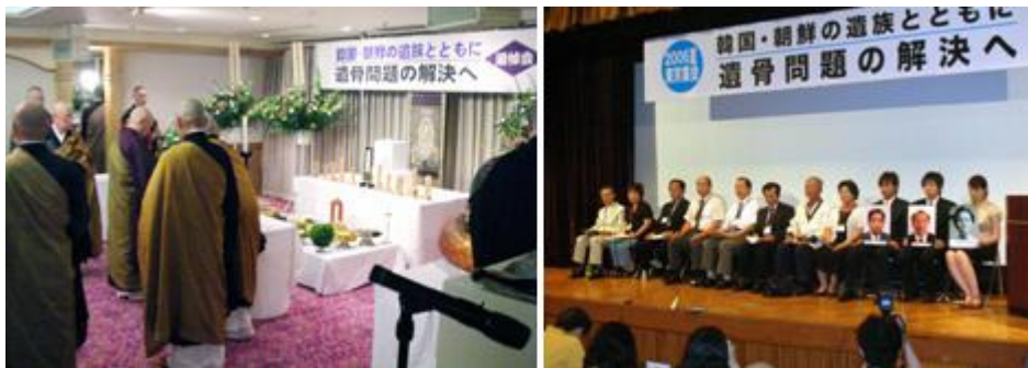
Tokyo memorial rites and public forum for Korean forced labor reparations, July 2006

kamikaze pilot who had died in combat after freely volunteering for military service; his family had previously known the remains of the Imperial Japanese Army officer were in Yutenji Temple but did not want them back. A Japanese national in life now embraced as Korean in death, the man's remains left Tokyo after a memorial service involving officials from the Japanese and South Korean governments, and were met in Seoul by state representatives.[81] South Korea's state-citizen unity in demanding forced labor reparations also involves a convergence of state nationalism and popular nationalism. As in China today, the former tended to suppress the latter with respect to historical issues prior to the Roh era; currently the two South Korean nationalisms are in a positive feedback loop and propelling each other toward a shared goal.