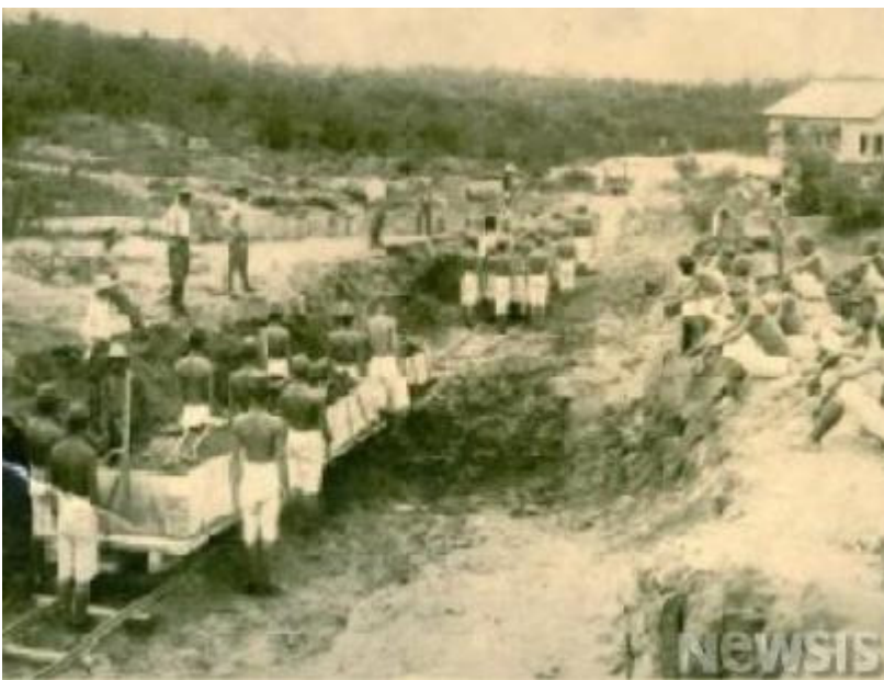
Korean military conscripts on Pacific island circa 1943

The government's remuneration plan for military conscripts was separate from the corporate deposit system for civilian conscripts, but the final result was identical: Korean conscripts were never paid. The emergence of information about the state scheme underscores the complementary nature of grassroots activism in Japan and South Korea, the cross-fertilization of redress efforts involving various subsets of forced labor, and the privileging by the Japanese government of hardships borne by military personnel above those of civilians.[56]