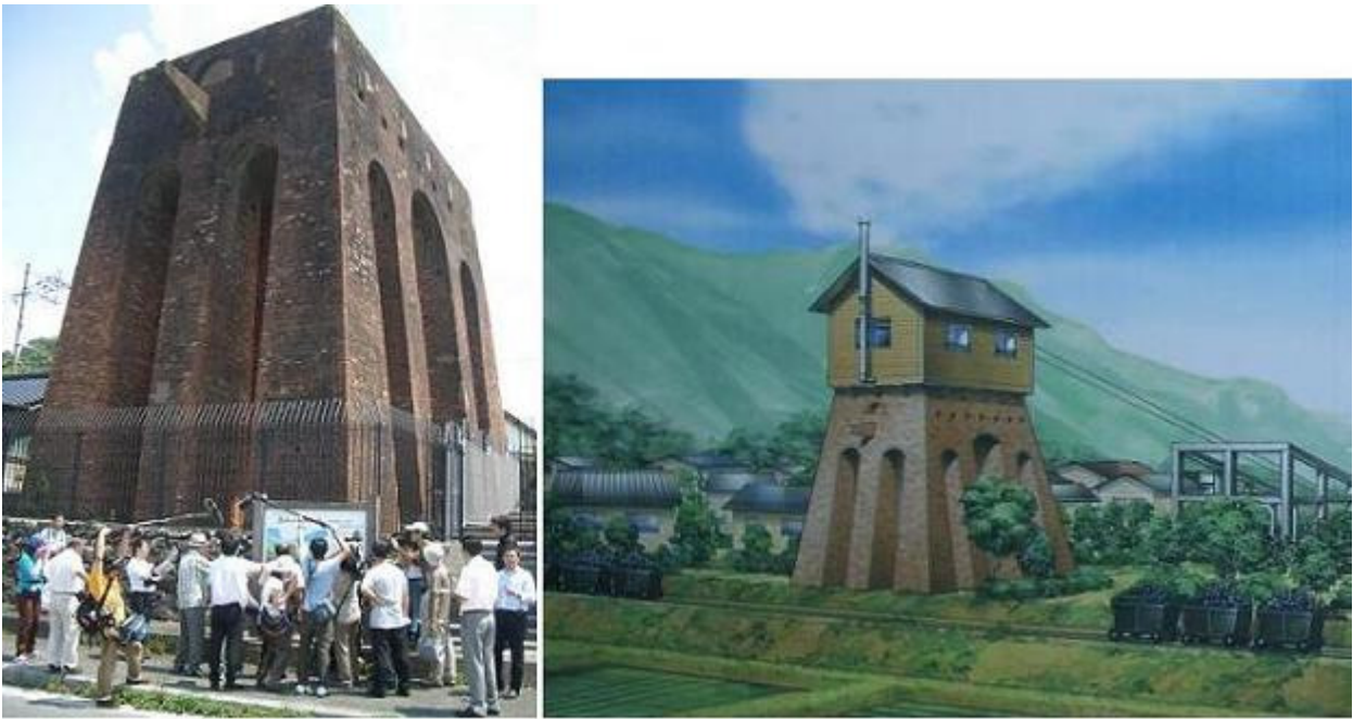
August 2006 tour by Korean relatives of Mitsubishi mine tower in Chikuho, along with historical rendering from the landmark's signboard