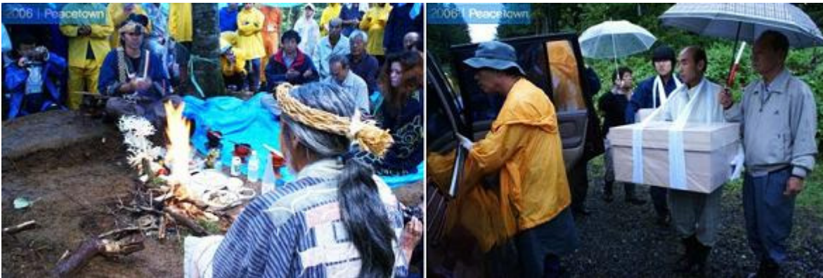
Ainu memorial rites for Korean forced laborers in Hokkaido and remains headed home to Korea, August 2006

Besides belatedly repatriating cremated Korean bones and ashes, the Japanese government is expected to eventually provide the South Korean Truth Commission with two long-suppressed master name rosters necessary for verifying the identities of applicants for certification as forced laborers. The Welfare Pension Name Roster was compiled by the Welfare Ministry during the war, as corporations withheld workers' mandatory contributions to the national pension fund. The Unpaid Financial Deposits Report details the wages and related allowances owed to workers but never paid out by corporations; it was compiled after the Welfare Ministry instructed companies to deposit these monies into the national treasury in 1946. In fact, the Bank of Japan today possesses 215,147,000 yen in unpaid wages for Korean forced laborers, with the deposits (consisting of 167,791,400 yen in cash and 47,355,600 yen in marketable securities) now worth perhaps $2 billion.[11] Surprisingly, the Truth Commission is not currently calling for release of the unpaid wage deposits. Rather, the Seoul government has proposed paying equivalent compensation from its own state coffers in documented individual cases. Tokyo has reportedly requested South Korean forbearance regarding the deposits until diplomatic relations can be restored with North Korea. Roughly ten percent of conscripts came from the north and their compensation claims are still open.