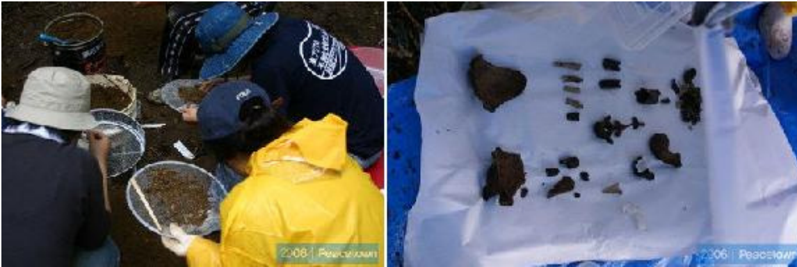
Asian students sift soil for Korean bones in Hokkaido, August 2006

Because Japanese society is sharply divided about the nature of Korean forced labor and labels for describing it, and because there is no strong consensus regarding Japan's colonial rule of Korea from 1910 to 1945, Japanese remain far from agreement with Koreans about how to come to terms with this major aspect of their nations' shared past. However, doing nothing about the legacy of forced labor, the prevailing approach for the past six decades, is no longer an option. The singularly complex and dynamic Korean forced labor reparations movement is being empowered by the direct involvement of the South Korean state and the activities of a transnational civil society that are without parallel in Asia or perhaps anywhere.