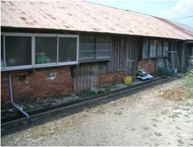
Former workers' quarters at Mitsubishi Iizuka mine

Ministry and GHQ, the League was informed that the Iwate proposal of the previous June had been officially withdrawn, prompting an extended angry protest by League representatives. Agreement was reached at that meeting to pay between 1,000 and 5,000 yen to Koreans back in Korea, but that plan was rejected by corporations the following month during meetings of the construction and mining industry groups.