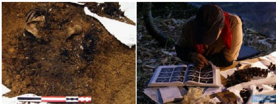
Identifying Korean remains exhumed from a Hokkaido field, August 2006

The current attitude of the Japanese government and corporations cannot lead to reconciliation with the South Korean government or society, which is not surprising given the long track record of evasion and duplicity regarding names, bones and unpaid wages. Reparations supporters pointed to a double standard last May 29, when 398 unidentified Japanese soldiers who had died on overseas battlefields or in Soviet labor camps were interred at Chidorigafuchi National Cemetery. Koizumi and other cabinet members, along with Prince Akishino, were among the 600 people who attended the dignified state ceremony for Japan's military war dead.[85] Japan treats Korean remains, activists charge while referring to Koizumi's recent Diet statement, as second-class cargo under the best of repatriation scenarios.