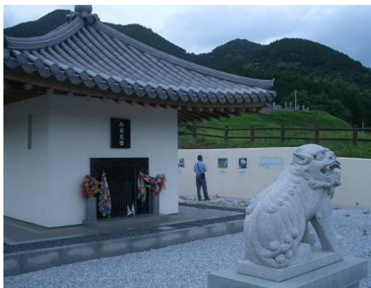
Mugunfa-do charnel house for Korean conscript remains, Chikuhō

The most revealing difference in the two labor programs was that 17.5 percent of Chinese died. Fatality rates exceeded 50 percent at some sites, as Chinese workers were subjected to uniquely high levels of brutality and deprivation by state and corporation design.[75] (About 10 percent of Allied POWs died in Japan, although overall death rates for Allied POWs in Japanese captivity were much higher for some nationalities including Americans. Korean labor conscripts died at far lower rates than Chinese or Allied POWs, although no precise figures are available.) While it appears that some corporations did deposit unpaid wages for Chinese workers with the central bank after the war, these efforts at damage control did not reflect a Korean-like system of mandatory savings accounts and pension withholdings. Instead, documents recently submitted by Chinese plaintiffs in a compensation lawsuit against Mitsubishi at the Nagasaki District Court indicate that the state specifically exempted corporations from applying the standard pension withholding procedures to Chinese, whose service in Japan the government today concedes was “half-forcible.” Mitsubishi is now pioneering denials of Chinese forced labor in three Kyushu courtrooms, a contestation of historical reality that has plagued Korean redress efforts for a far longer period.[76]