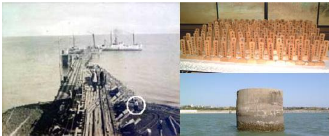
Chosei Mining's undersea mine near Ube city, concrete ventilation shaft, and Korean mortuary tablets

Academic exchange activities involving universities in South Korea and Kyushu (which is geographically closer to Seoul than Tokyo) have critically examined the Chikuho conscription experience. One second-generation zainichi Korean man has visited nearly 400 public schools in Fukuoka and Yamaguchi prefectures, educating younger students about forced labor while exposing them to traditional Korean clothing and music.[70] For more than twenty years, the "Group for Thinking about Forced Labor" has featured food, song and dance in its Korean-Japanese cultural exchange programs. The group has long conducted Chikuho bus tours of memorials, former worker dormitories and closed-off mine shafts, including one site where 67 burakumin workers died in a 1960 mine flood. Nobody attempted to rescue the Japanese miners or retrieve their bodies due to discrimination against the outcaste class. One effect of the bus tour was to frame the forced labor reparations issue within the context of other human rights problems in Japanese society.[71]