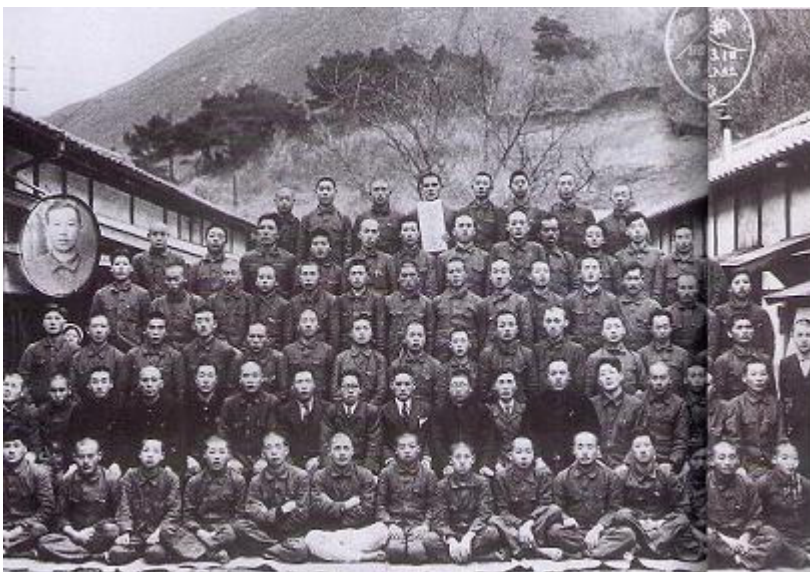
Group-imported Korean workers upon moving into quarters at Mitsubishi Kamiyamada coal mine, March 1942

Illustrating the negotiated nature of the court-mediated settlements, Nachi-Fujikoshi agreed to erect a memorial on factory grounds but refused the plaintiffs' desired wording of the inscription in Japanese and Hangul, leaving neither side wholly satisfied. In the most recent—and quite possibly final—settlement, textile maker Teijin Ltd. in 2004 voluntarily paid out the symbolic sum of 200,000 yen (less than two thousand dollars) to each of ten South Korean women without even being sued, having previously absorbed the spinning factory that actually conscripted the women. None of the four corporate settlements, however, have benefited more than a handful of Korean forced labor victims. The remainder of cases has ended in the rejection of claims, nearly always at the district court level. Unlike in litigation involving Chinese forced labor and other injustices in which courtroom defeats have produced an invaluable historical record, judges in Korean conscription cases have tended to withhold all comment on the veracity of plaintiffs' assertions.