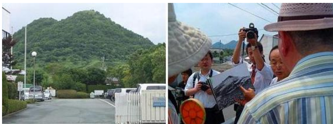
Japanese guide describes Sumitomo Mining’s Iizuka slagheap for Korean relative with back to camera, August 2006

“Burnable rocks” were first discovered in the Chikuho region of northern Kyushu in the late fifteenth century. Feudal rulers gradually developed the coal resource in the eighteenth century, and with privatization during the Meiji era Chikuho came to supply fully half of national production, largely in the form of high-grade coking coal produced by small- and medium-sized firms. Most mines closed during the 1960s following Japan’s shift to a petroleum-based national energy policy, with the last mine shutting down in 1976. Vegetation now covers the remaining conical slagheaps, some of them up to 100 meters high. Known as the “Mt. Fuji of Chikuho,” the Sumitomo Mining slagheap that looms over Iizuka city was for many years decorated with strings of lights, until the city decided to promote an image less tied to its mining past. Other slagheaps have disappeared altogether. Mitsubishi perfected a technique for recycling its mining debris for use by the corporation’s massive concrete enterprise, while other firms leveled their slagheaps for use as bed fill in bullet train and expressway construction projects.